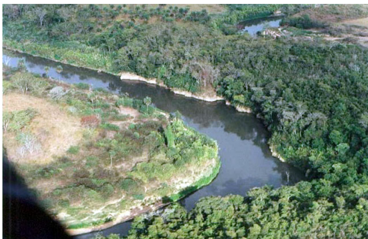
Figure II: Rio das Velhas, Minas Gerais, Brazil. Lacking mainstem or major tributary dams, the Rio das Velhas floods during the rainy season and supports multiple, permanent, off-channel lakes (lagoas) providing reproductive and rearing habitat for aquatic vertebrates.