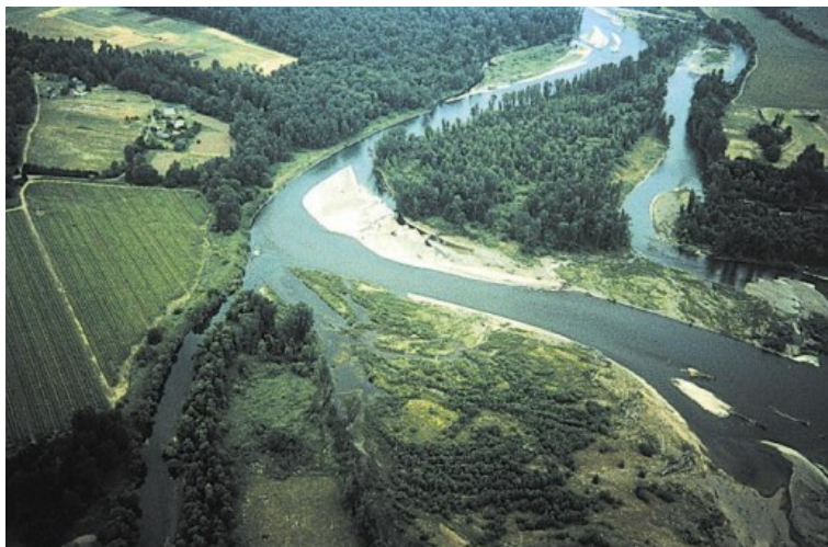
Figure I: The Upper Mainstem Willamette River, Oregon, USA. Despite being channelized in the early 20th century and having multiple hydropower dams in its major tributaries, the upper mainstem of this floodplain river retains channel complexity in the form of side channels, islands, and alcoves.