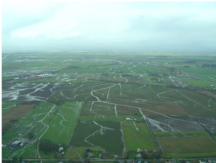
Figure VII: Intermittent tributaries of the Calapooia River, Oregon, USA. Nearly all of the visible channels (agricultural ditches) are only wet during the rainy season, yet they provide overwintering refuge habitat for spawning and rearing native fish, including salmonids.