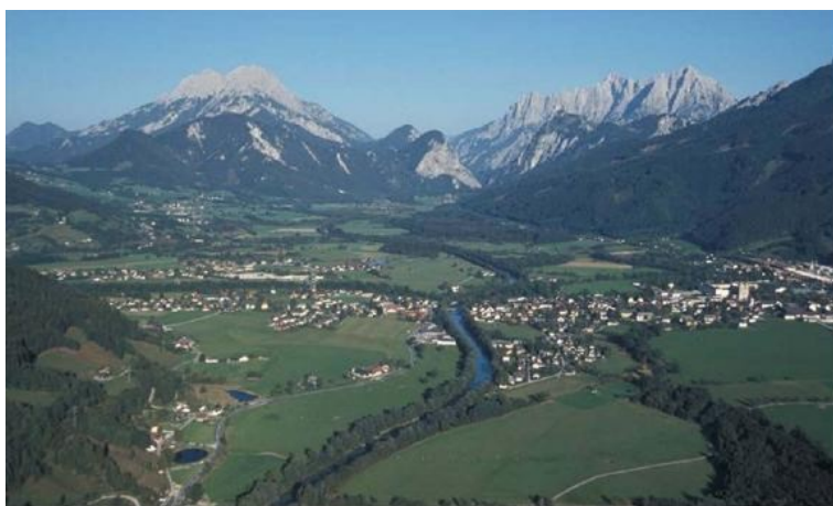
Figure VI: The River Enns, Styria, Austria. Hydropower dams, canals, and channelization limit connectivity of the Enns with its floodplain.