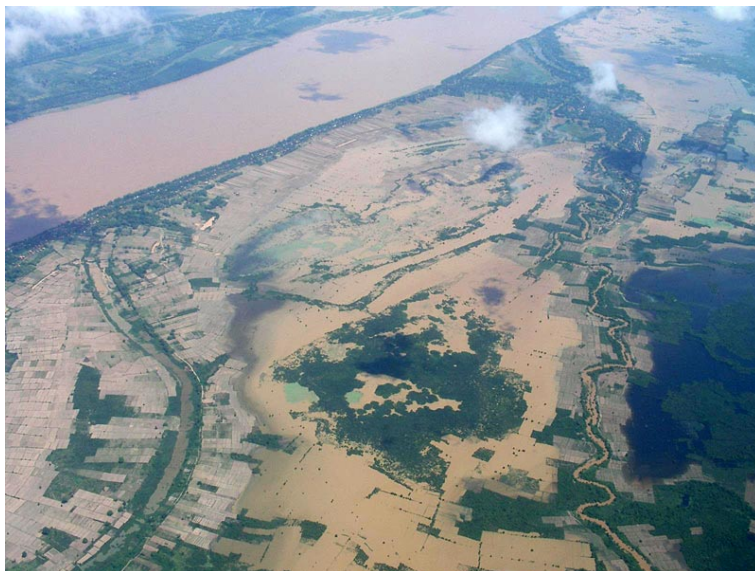
Figure V: Mekong River and its tributary in Cambodia. Photo taken by Seiichi Nohara during the rainy season. The tributary of this floodplain river is visible only because the riparian forest canopy is barely higher than the water level.