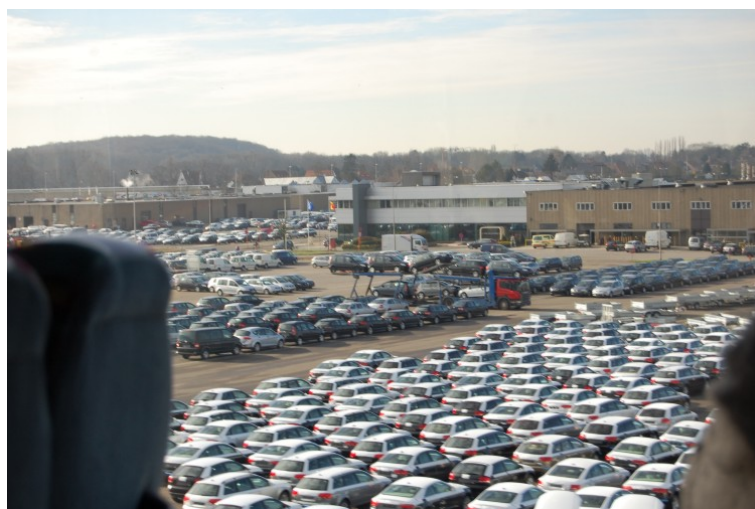
Figure 2: A typical form of urban fringe land use: retail and storage facilities in the countryside between Leuven and Brussels, Belgium.

as a socio-economic instrument in urban fringe regions. An example of econometric modeling in fringe areas, where the competition between residential and agricultural land use is explained using variables like distance to the nearest town or metropolitan area (Chicago in this case) can be found in the work by McMillen (1989).