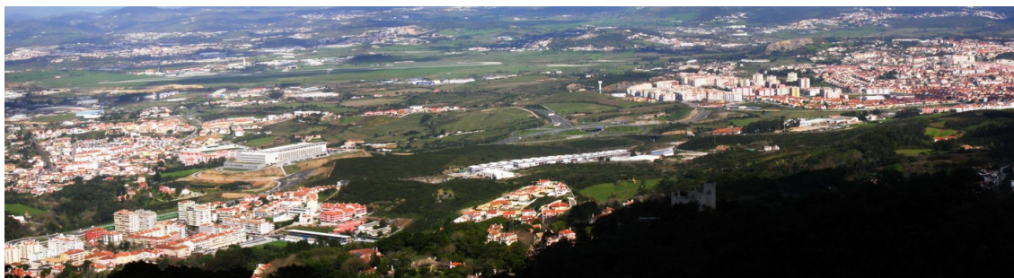
Figure 5: Panorama of a semi-urban landscape seen from the hills of Sintra, north of Lisbon, Portugal.

A specific method of studying urban fringe systems and sprawl, which is related to urban cores, is gradient analysis. Good examples of this method are the studies of McDonnell (McDonnell and Pickett, 1990; McDonnell et al. , 1997), the detailed rural–urban gradient analysis of the area around Phoenix by Luck and Wu (2002), and the GIS based gradient analysis of the urban landscape and sprawl dynamics in China, in Shanghai (Zhang et al. , 2004) or Guangzhou (Yu and Ng, 2007). Other rural–urban gradient studies cover ecological indicators (McKinney, 2002), residential building patterns (Weng, 2007), land use properties like vegetation type (Zhao et al. , 2007), sealed surfaces (Jennings et al. , 2004), or building densities (Longley and Mesev, 2002).