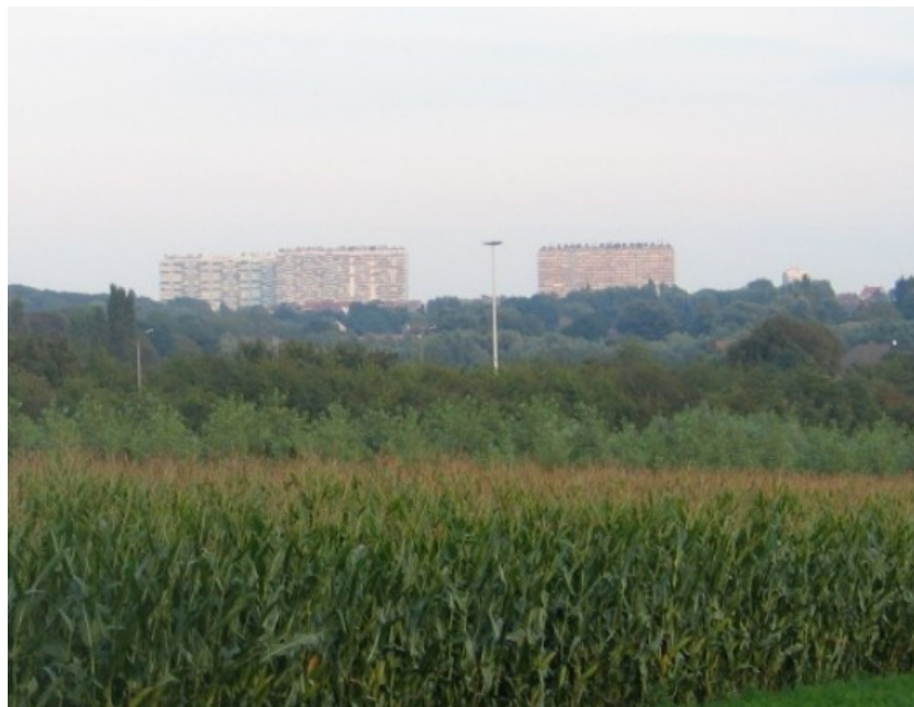
Figure 1: Landscape in the fringe of Brussels with an agricultural character.

Rural areas are also subject of a rapid urbanisation process, especially in many European regions, like the fringe of Brussels (Figure 1). Modern traffic and communication technologies have exported the urban way of life to the countryside putting pressure on rural traditions and way of life. It makes that the traditional harmony and responsiveness between agriculture and society has been broken and requires reinstatement (Delgado et al. , 2003).