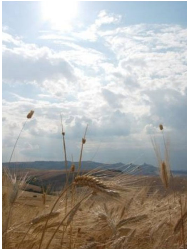
Figure 3: View on a Tuscan landscape with an agricultural character.

may be interlinked (complementary or substitutes) as illustrated with the example of fertilisation that may be positive for landscape quality but reduces biodiversity or water quality (Casini et al. , 2004).