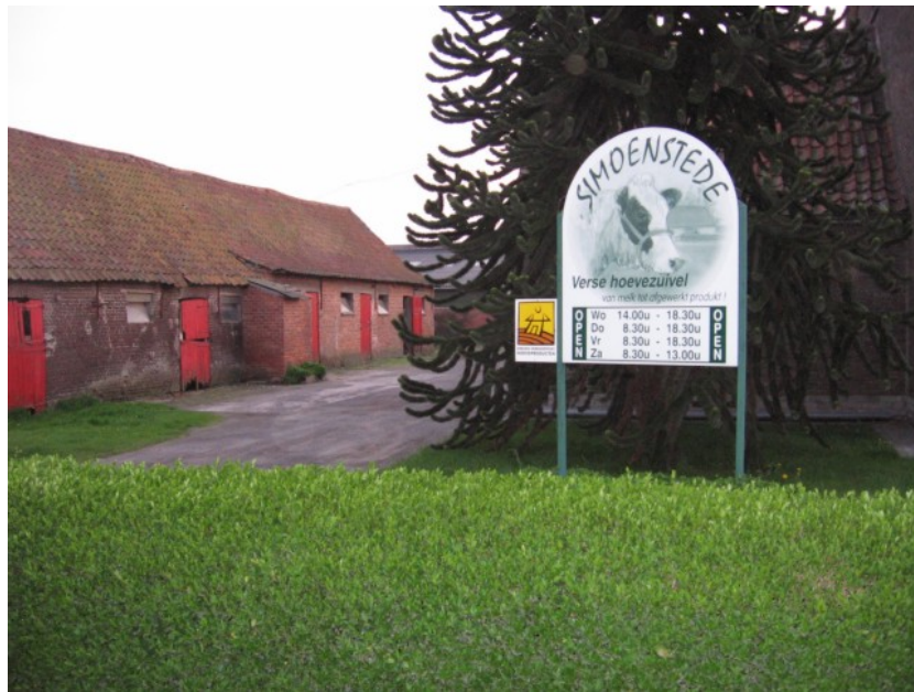
Figure 5: Example of farm sales in Flanders.

and the forging of relationships between local and external sources of expertise, information and advice are fundamental to the future of existing rural communities. Social viability includes maintenance of the cultural heritage. Societies still identify intensely with their historical origins in agrarian communities and rural lifestyles.