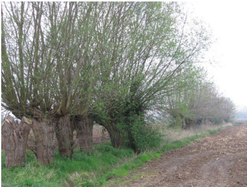
Figure 7: A row of pollard willows on the edge of an agricultural parcel in Belgium.

Although the above overview is probably not complete and not overwhelming – there is certainly a need for more empirical research in this area – the evidence given shows that agriculture has