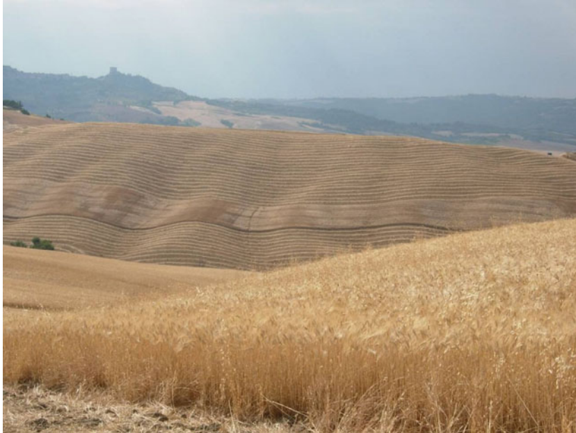
Figure 9: Tuscan landscape with an agricultural character.

stimulating multifunctionality and diversification of the production system (Vandermeulen et al. , 2006). Hereby the development of indicators linking socio-economic requirements with landscape and territorial potentials may be a promising avenue (Wiggering et al. , 2006).