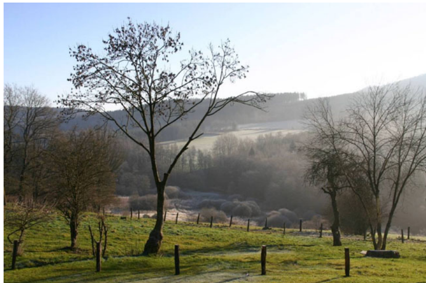
Figure 6: View on an agricultural landscape in the touristy Belgian Ardennes.