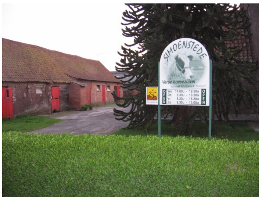
Figure 5: Example of farm sales in Flanders.

and the forging of relationships between local and external sources of expertise, information and advice are fundamental to the future of existing rural communities. Social viability includes maintenance of the cultural heritage. Societies still identify intensely with their historical origins in agrarian communities and rural lifestyles.